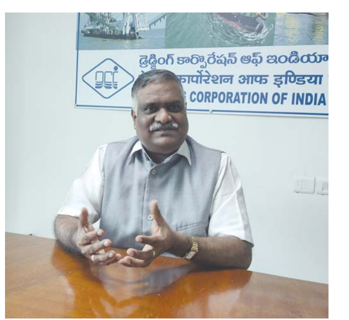
We are also in talks with Andhra Pradesh Maritime Board for Capital Dredging for 2 of the 3 greenfield ports.

In fact the Gujarat government had already given it the mandate to develop fishing harbours on the coast of Gujarat. Works have already commenced at Mangrol Fishing harbour in Gujarat. And to better coordinate its works in Gujarat it is soon slated to start its new office in Gujarat.